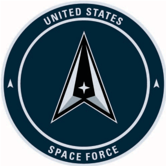
Exhibit 2 – USSF Seal – Use and users of the USSF Seal mirror those for the USAF Seal and is directed by AFMAN33-326, Communication and Information , Attachment 2.